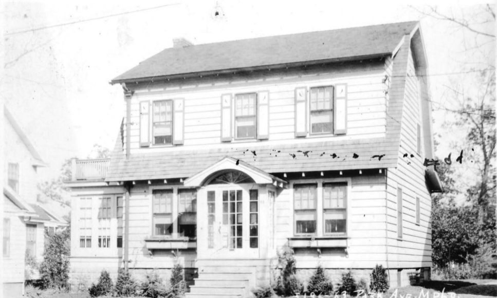
1903 212 K Ave. M. Pk. BOARD OF REALTORS of the ORANGES & MAPLEWOOD